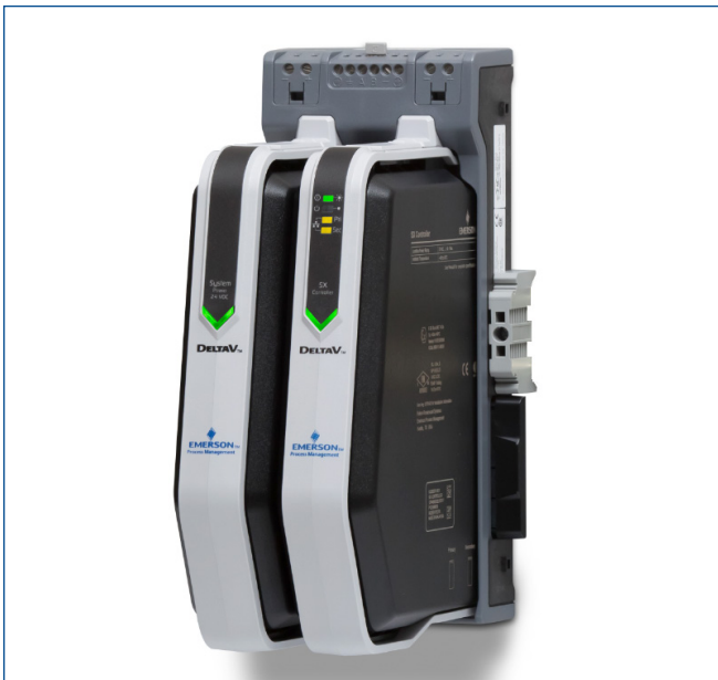
The SX Controller.

Field Proven Architecture. The SX controller is an evolution of the DeltaV MX controller. The new design delivers installation and robustness enhancement while still using the same processor and OS that has proven itself in the field. All IO cards run the latest software enhancements of corresponding M-series IO cards and deliver the same field proven, reliable operation.